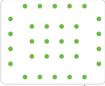
Deployment Grid 5 - 10m<sup>2</sup>

For areas up to 50m<sup>2</sup>: Position the holders around the edges of the room 5m apart utilising wall surfaces where possible. For areas greater than 50m<sup>2</sup>: Position holders in a grid format 5m apart. Start from the edges of the room utilising wall surfaces first. Distribute remaining tablets throughout treatment area on other suitable surfaces and structures.